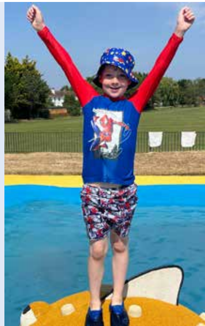
Joseph Hood Recreation Ground's paddling pool