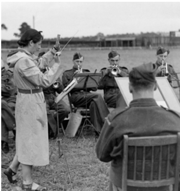
Members of the local Home Guard perform at the Mitcham Carnival in the Mitcham Stadium