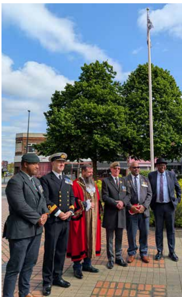
We raised the Victory in Europe Day flag on 8 May, the 80th anniversary of World War II coming to an end in Europe

16 August, 10.30am–4.30pm, Merton Civic Centre, London Road, Morden.